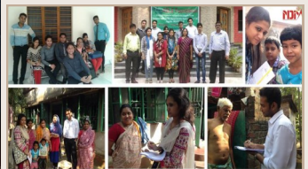
NDIMites undertook a CSR project for Able Foundation