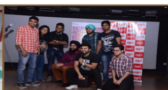
India's leading FM Channel Radiocity 91.1 FM @ NDIM