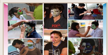
NDIMites showcased their creativity @ Spandan 2016