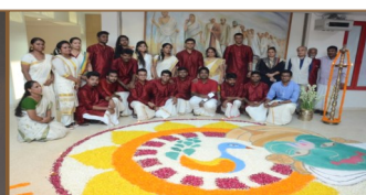
Campus Rejuvenates with Onam Celebrations 2016