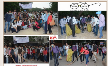
NDIM students taking the lead for 'Swachh Bharat'