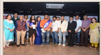
Electrified and Energetic Fresher's 2016